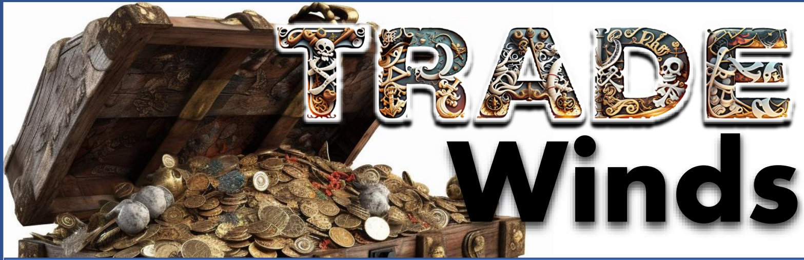
Chart Your Course; Seize the Treasure